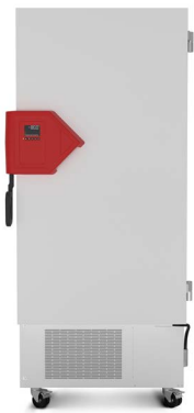
Model UFV 500