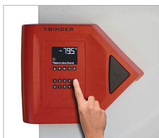
Door access system