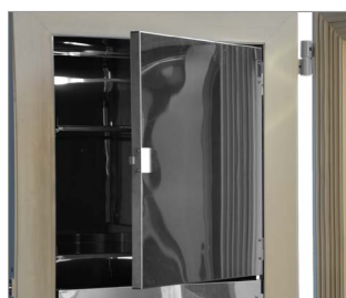
Foam-filled compartment doors with gasket