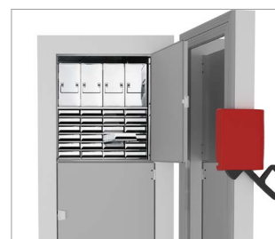
Selection of racks and boxes